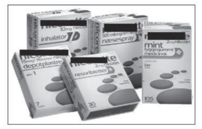
Commercially available forms of NRT

Monotherapy of NRT provides lower level of plasma nicotine as compared to that produced by cigarette smoking. While monotherapy has been shown to be effective in majority of smokers, others, especially those who are hard-to-treat, may require combination strategy. Effective combination of first-line medications are: Long-term (more than 14 weeks) nicotine patch with other NRT (gum and spray), nicotine patch with nicotine inhaler and nicotine patch with bupropion SR. The common combination is an NRT patch (which gives a regular background level of nicotine) with gum or a nasal spray (taken every now and then to top up the level of nicotine to ease sudden cravings). Combination of pharmacological agents with behavioural intervention have been found to increase the chances of successfully quitting.