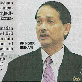
DR NOOR HISHAM

PUTRAJAYA - Kementerian Kesihatan (KKM) menyasarkan 2,000 petugas kesihatan sama ada yang telah penenak untuk kembali bertugas membantu Kementerian menangani wabak koronavirus (Covid-19). Ketua Pengarah Kesihatan, Datuk Dr Noor Hisham Abdullah berkata, pihaknya sedang merangka pelan bagi perancangan tersebut. "Jumlah 2,000 itu termasuk pakar perubatan yang telah bersara, jururawat dan pelatih graduan perubatan," katanya di sini semalam. Menurutnya, kementerian juga sedang meneliti kontrak pegawai perubatan. "Kita dalam proses melihat kembali, graduan perubatan kita perlu latihan terlebih dahulu. "Apa yang penting, jururawat dan pakar yang bersara memiliki kepakaran dalam bidang masing-masing," katanya. Pada 17 Mac lalu, Menteri Kesihatan, Datuk Seri Dr Adham Baba berkata, KKM sedang berusaha menambah 830 jururawat bagi menampung kapasiti di 135 hospital.