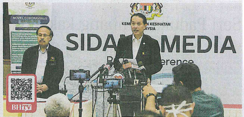
Dr Noor Hisham pada sidang media berkenaan COVID-19 di Kementerian Kesihatan, Putrajaya, semalam.

Beliau berkata, kematian ke-14 pula ialah kes ke-595, iaitu wanita