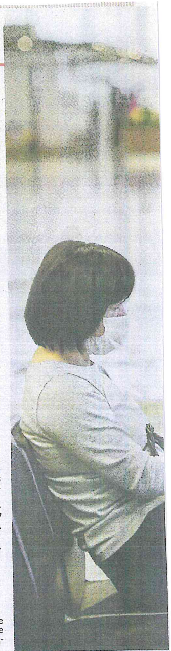
A woman wearing a face mask waiting for a flight at Kuala Lumpur International Airport on Saturday.