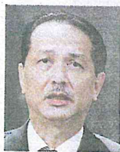
DR NOOR HISHAM

"Berikutan jangkitan Covid-19 di Malaysia, penjualan topeng muka meningkat tiga kali menyebabkan kekurangan bekalan, selain pengeluaran mengeksport produk ini pada harga yang tinggi," dakwanya pada sidang media di sini semalam. - Bernama