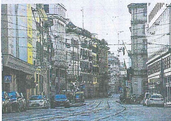
The deserted Via Manzoni in central Milan, after millions of people are placed under quarantine in northern Italy yesterday.