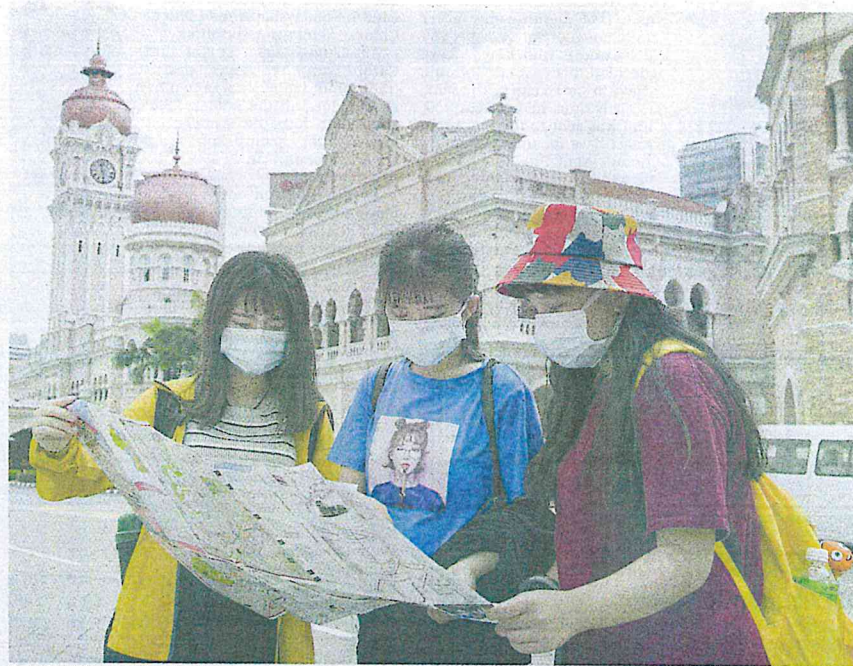
PRECAUTIONARY MEASURE ... A group of Taiwanese tourists don face masks during their visit to Dataran Merdeka as a safety precaution in light of the Covid-19 outbreak. The public are advised to put on face masks when visiting public areas to avoid contracting the virus. — BERNAMAPIX

Noor Hisham said 24 people have recovered from the disease so far, following the recovery of case 41. — by Rajvinder Singh