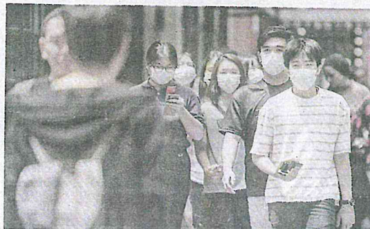
Pemakaian topeng muka oleh orang ramai dilihat sudah menjadi kebiasaan sebagai langkah pencegahan susulan penularan jangkitan Covid-19.

"Daripada jumlah tersebut, sebanyak 18 kes dikesan dalam