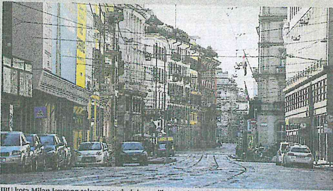
IBU kota Milan tengang selepas penduduknya dikuarantin, semalam.

"Aktiviti pengesanan kontak rapat masih dijalankan sehingga punca di mana jangkitan ini terjadi dapat dikenal pasti," katanya