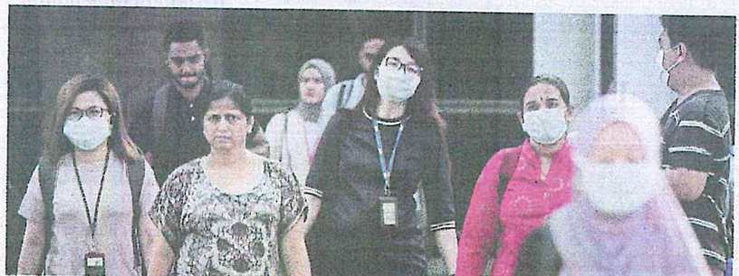
Orang ramai dinasihat meningkatkan tahap kebersihan bagi mengekang penularan COVID-19. (Foto hiasan)

Kajian oleh sekurang-kurangnya 36 penyelidik dari hospital dan institusi perubatan di China itu mendapati kurang separuh daripada mangsa terbabit menunjukkan simptom dijangkiti virus berkenaan apabila kali pertama bertemu doktor.