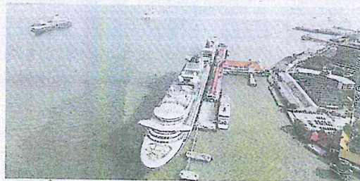
Seramak sejuta pelancong yang datang ke Pulau Pinang melalui pintu masuk pelabuhan Swettenham Pier Cruise Terminal sepanjang tahun lalu.

Menurutnya, kemasukan dan persinggahan kapal persiaran, penumpang serta anak kapal memerlukan penyediaan sumber perubahan yang banyak