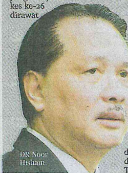
DR Noor Hisham

Kuala Lumpur: Kementerian Kesihatan Malaysia (KKM) sedang menyiasat dua orang kenamaan yang dikatakan dijangkiti koronavirus baharu (Covid-19) yang dikaitkan dengan kes ke-26 di negara ini. Ketua Pengarahnya Datuk Dr Noor Hisham Abdullah berkata, individu yang menjadi kes ke-26 dirawat