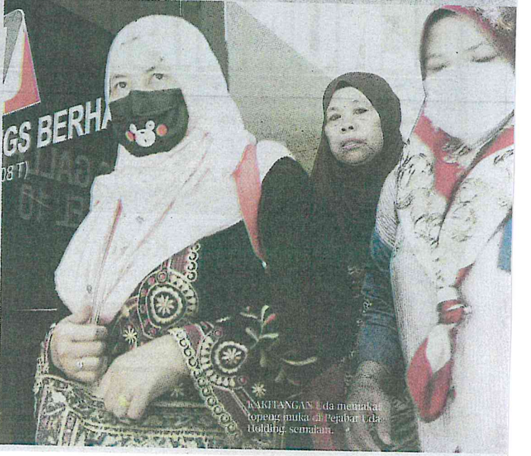
MAJLIS Uda memulakan topeng muka di Pejabat Uda Holdings, semalam.