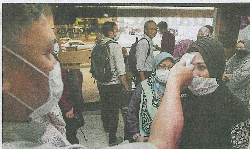
Pekerja UDA Holdings Berhad menjalani pemeriksaan suhu badan di Pejabat Uda Holding, semalam.

Katanya, AHKL mengambil langkah sewajarnya menggunakan garis panduan KKM untuk kerja membersihkan seluruh kawasan hotel.