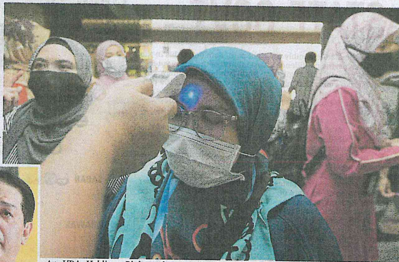
An UDA Holdings Bhd employee undergoing temperature screening in Kuala Lumpur yesterday.

tests on Case 26's family members, personal assistant and a private healthcare employee who were in close contact with him.