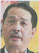
Datuk Dr Noor Hisham Abdullah