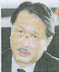
DR NOOR HISHAM

kan siasatan terhadap kedua-dua individu tersebut selepas dikaitkan dengan seorang ahli Lembaga Pengarah UDA Holdings yang positif jangkitan wabak berkenaan pada Sabtu lalu.