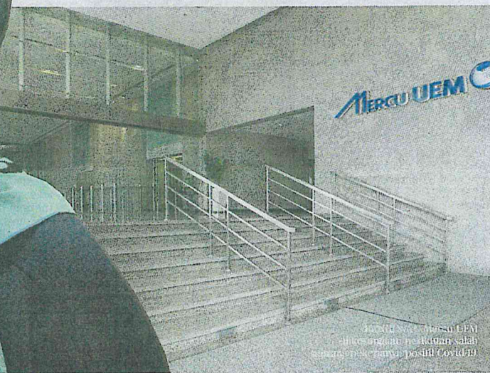
Ahli Lembaga Khazanah LBN disahkan positif Covid-19 selepas bekerja di bangunan Mercu UEM.