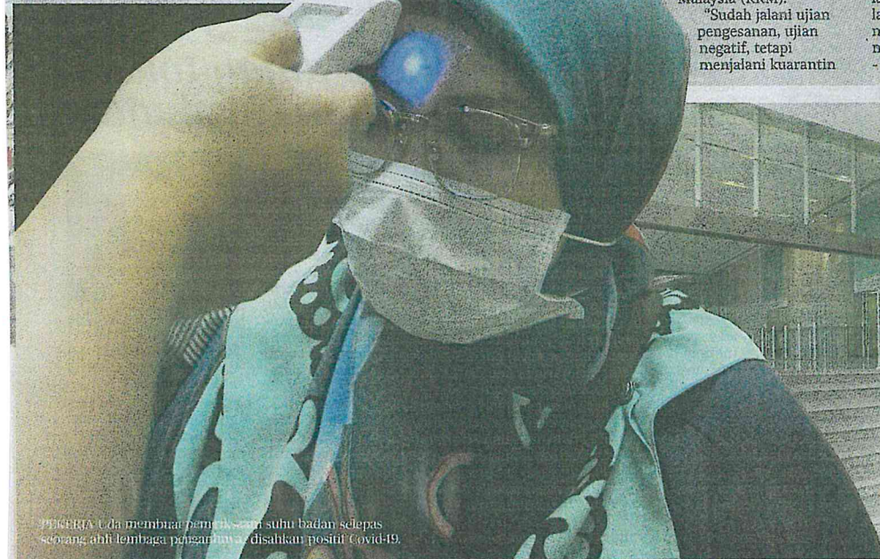
PEKERJA Uda membuat pemeriksaan suhu badan selepas seorang ahli lembaga pengarahnya disahkan positif Covid-19.

sendiri di rumah. "Saya sihat, Alhamdulillah," kata wakil rakyat itu. Tular di media sosial sejak kelmarin mengenai bekas menteri dan timbalan menteri dipercayai kontak rapat dengan kes ke-26 positif Covid-19 dan berhubung langsung dengan orang lain termasuk petugas media, sehingga mencetuskan kekhawatiran. - Bernama